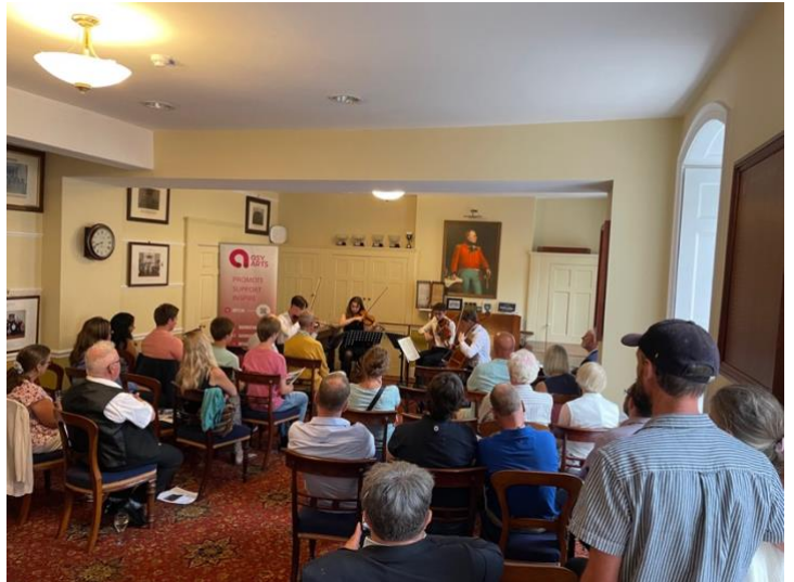
The Crwth Quartet at the St Peter Port Constables' Office